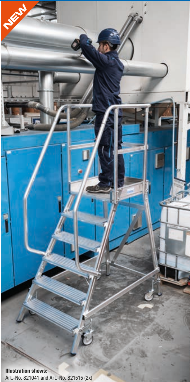
Illustration shows: Art.-No. 821041 and Art.-No. 821515 (2x)