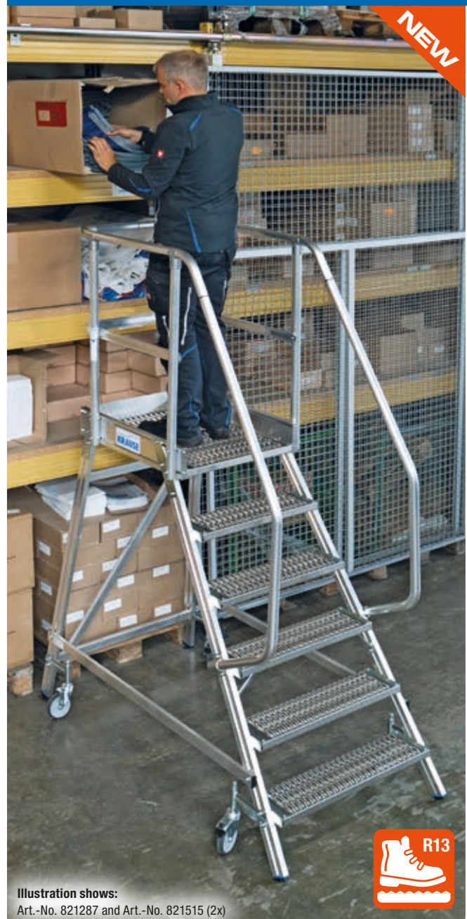
Illustration shows: Art.-No. 821287 and Art.-No. 821515 (2x)